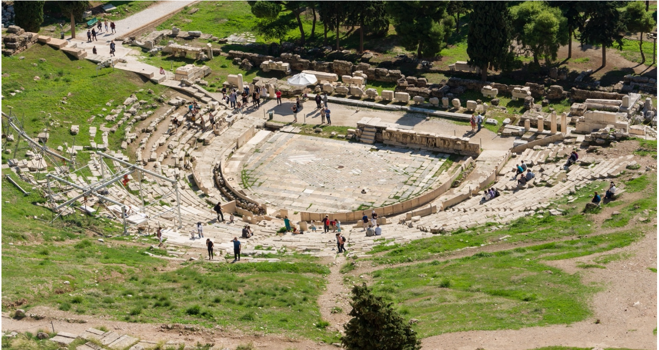
Image: The Theatre of Dionysus, Athens.

https://commons.wikimedia.org/wiki/File:Theatre_of_Dionysus_Acropolis_Athens_Greece.jpg , reproduced under the CC0 1.0 Universal Public Domain Dedication.